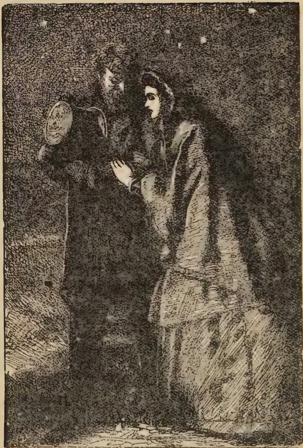
WITH ESTELLA AFTER ALL.